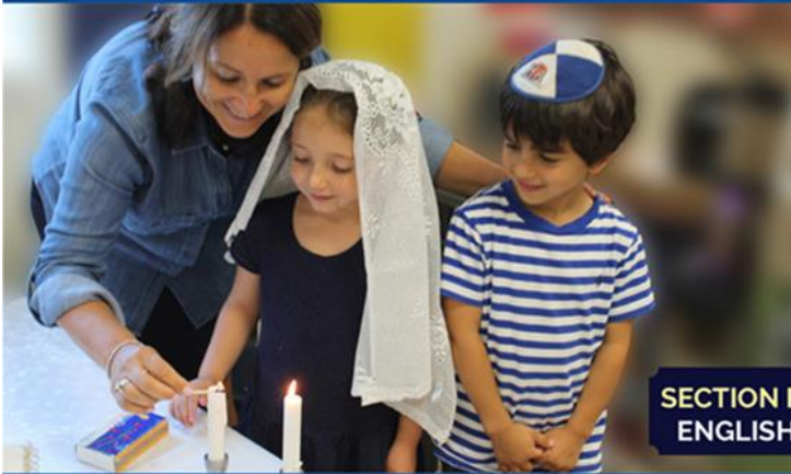
SECTION FRANÇAISE ENGLISH SECTION

TUESDAY, NOVEMBER 8 AT 7:30PM • MARDI, LE 8 NOVEMBRE À 19H30